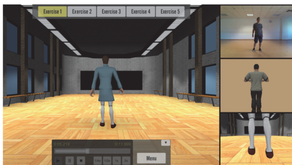
Figure 3: Practice Screen: Backward View of 3D Expert Avatar (Big Central Window), Animation Controller (Bottom Center), Exercise Indicator (Top Center), Expert Video (Top Right), 3D Learner Avatar (Center Right), Backward View of Close-up Expert Legs (Bottom Right).

The application communicates with the Body and Gesture Data Capture and Analysis Module that is