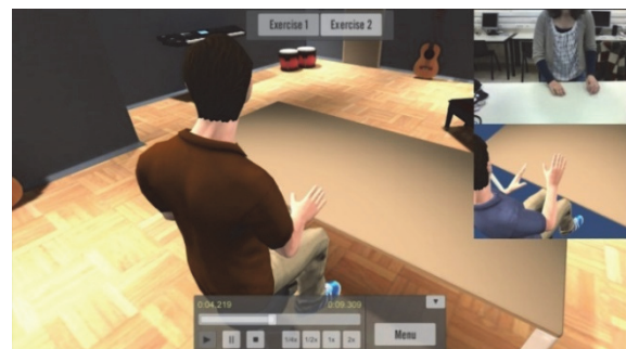
Figure 6: Practice Screen: Isometric View of 3D Learner Avatar (Big Central Window), Animation Controller (Bottom Center), Expert Video (Top Right), Close-up Expert Hands (Center Right).

The musical game activities include observe and practice phases. In the observe phase, the learner can observe the video of an expert performing a musical gesture.