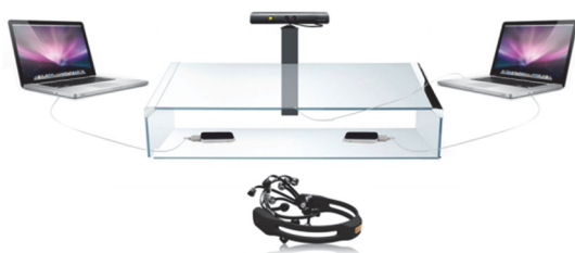
Figure 5: Detailed description of IMI sensor setup.

This prototype setup is integrated into a game framework where the user/learner is assessed by the