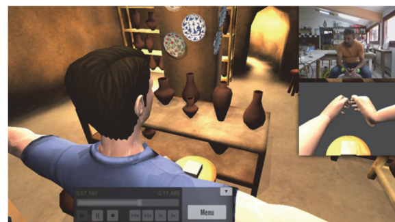
Figure 4: Practice Screen: Angled View of 3D Learner Avatar (Big Central Window), Animation Controller (Bottom Center), Expert Video (Top Right), Close-up on Expert Hands (Center Right).