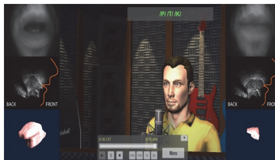
Figure 2: Practice Screen HBB Game.

The learner should practice each activity a number of times, and finally perform all the activities at once. The practice screen of the HBB game is illustrated in Figure 2.