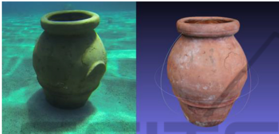
Figure 1: Reconstruction of a jar starting from a video capture.

Pizarro, 2004 and T. Nicosevici, 2013). From this point cloud, the system builds an optimized mesh (created by the triangulation of the Poisson surface that better fits the point cloud), using dedicated software such as Meshlab (Meshlab) and/or Blender (Blender). Finally the mesh is exploited to obtain the detailed 3D model of the object. Figure 1 shows the original Jar acquired and, on the right, the final output of the processing pipeline.