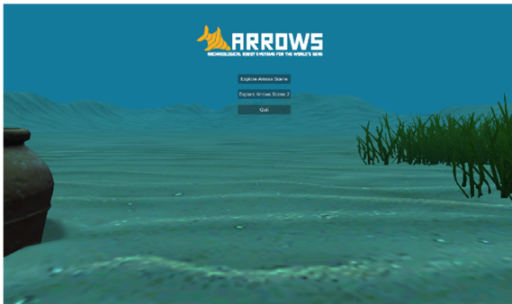
Figure 4: The main menu of the scene navigation system.

In this section, we will describe a generic usage case generated starting from an acquisition campaign performed in a controlled realistic scenario. The campaign has been focused into the acquisition of a jar placed on the seabed.