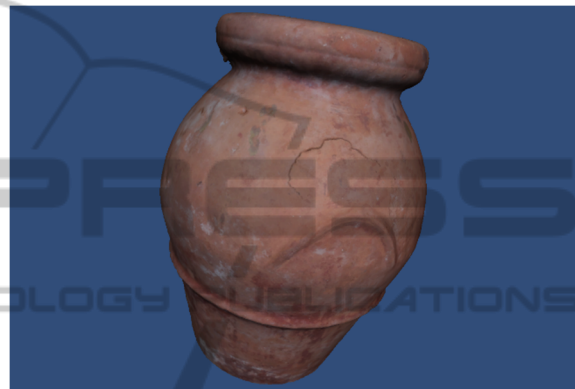
Figure 5: 3D model of the jar extrapolated from the scene context and without light effects.

By accessing to the desired scene, the user will have the navigation control. From now on, the user can freely explore the scene and interact with the object placed in it. For instance, Figure 2 shows the interface through which it is possible to obtain further information about the jar. In this case, user can view the stream of the video acquired during the campaign, view the jar, extrapolated with the scene and without any light effects (Figure 5), and/or obtain archive information.