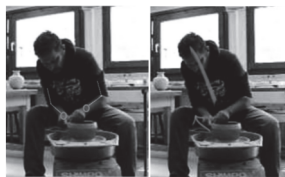
Figure 2: Expert’s video with colocalisations.

To help the pottery learner reduce this distance we propose a pedagogical application, accompanying him in the learning process. Always inspired from “in person” transmission we start by providing the annotated video, reminding to the learner the most important cinematic of the gestures, such as body postures, gesture trajectories etc., as shown the figure 2.