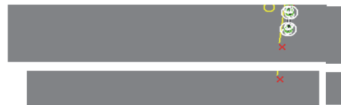
Figure 3: Implicit optical feedback - visualisation of angle deviations at X and Y axis for the left hand.

To active this implicit feedback we train the system with one indicative expert model of the first gesture, and we ask to the learner wearing the sensors to perform this gesture. To send the data flow from the sensors to our application in real-time we use the OSC protocol. At this stage HMMs are not mobilized since the system is trained only with the gesture the learner wants to practice. But DTW is aligning the 2 sequences and it permits us to calculate and to visualise the absolute value of learner’s distance.