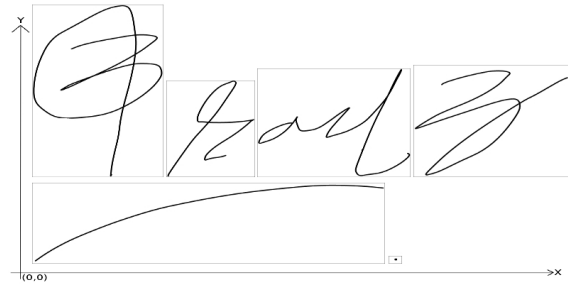
Figure 2: Strokes of the signature shown in Figure- 1, blocks are in left to right and top to bottom order.

Since the user may put his/her signature on any region of the screen, the X-Y coordinates are always translated so that the point given by the mean coordinates becomes the new origin of the coordinate system.