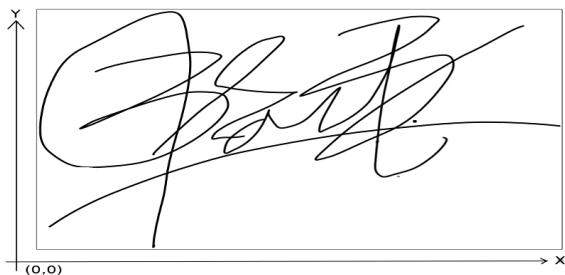
Figure 1: Handwritten online signature.

An online handwritten signature on a digital device is a series of points, and each point is represented by a vector in four dimensions, X, Y, Pressure and Time. We define these series of points as dynamics of the signature. When the user writes the signature, s/he might do pen-up and pen-down moves rather than moving the pen tip continuously. We define a stroke (ST) as the trajectory of a pen tip between a pen-down and a pen-up. A signature can be partitioned into multiple strokes as shown in Figure 1 and in Figure 2.