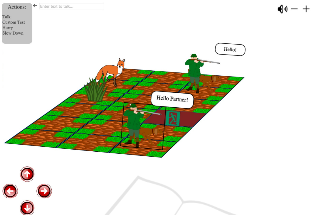
Figure 2: Screenshot of the prototype virtual world scenery generated from the modeled instance.