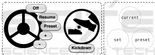
Figure 1: Events users can trigger (left) and variables of the system (right).

For our work on the ASL case study, we were provided with the following documents by our industrial partner: