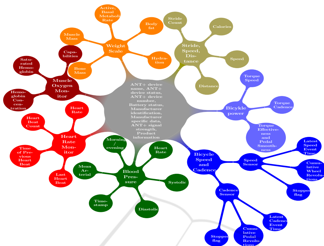
Figure 1: ANT+ Profiles Network.