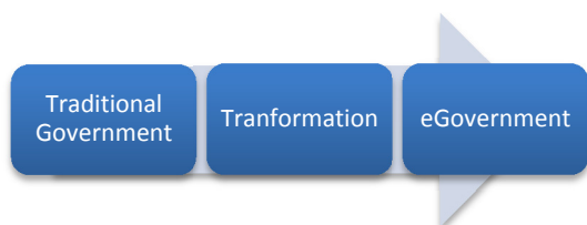
Figure 2: e-Marketing of Government Initiatives for Citizens' Satisfaction.

E-marketing of government projects is new concept and it can provide real-time information about government projects to its citizens and help the government to overcome the failure rate of its development projects. However, low costs and digital processing allows government to approach huge number of population, e-marketing can help Pakistan to improve the public sector performance. E-marketing is relatively new way to approach citizens, in manual system government cannot reach people easily whereas through e-marketing government can improve its efficiency and effectiveness. In government projects, main focus on targets achievements without taking on board the citizens become the reason for projects failures. Nevertheless, many government projects fail because of gap between targets achieve by government in papers and in real ground story is totally different (Heeks, 2006). Thus, e-marketing is the only way by that government can provide all its information to people and get their feedback through emails or other electronic means. As a result of this, gap between traditional government and e-government can be identified (see figure 2). In this way, this research is to study the gap and to provide e-marketing model/framework for government initiative in Pakistan to improve public sector performance and citizens satisfaction.