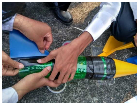
Figure 2: Water rocket project development process.

they can directly perform the process of making the water rocket game up to analyze the existing concepts. Sumarni (2014) explains one of the advantages of using PjBL in learning is to improve student motivation. When teachers are able to apply PjBL, students can improve their motivation well and produce complex and high-value work. Followed by Chiang and Lee (2016) explains that the PjBL method is able to improve students' learning motivation rather than traditional learning methods.