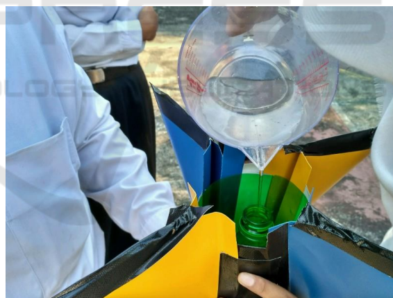
Figure 3: Water rocket project development process.

In making water rocket, the lecturer uses free inquiry method which means students are directed to make the hypothesis and problem formulation, designing tools and materials, assembling tools and materials, taking data, analyzing data, and taking conclusions independently with each group. It aims to train students' creative thinking skills and encourage them to collaborate. In addition, giving freedom in making water rockets will motivate students to search the literature and find out the ideal design of props independently.