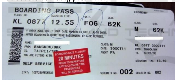
Figure 2: Example of Cognitive Map Question.