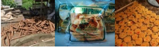
Figure 2: Transformation of Cassava into Product Kicimpring Guided PKBM Ash-Shoddiq Pagerwangi Village.

already has the identity of "Nugraha Rasa" and is registered in BOM with halal certified. Its products are sold with the cooperation of several stores and utilize the internet media. In fact, the creativity of this kicimpring effort has been published in television shows and other printed publications. This shows that the product has received high attention among the community.