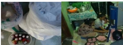
Figure 3: Transformation of Rice Flour into Ranginging Guided PKBM Bhakti Pertiwi Desa Cimenyan.

Unlike the previous product, the product built by PKBM Bhakti Pertiwi Desa Cimenyan is still stage of development. Citizens started their business by producing ranginging by utilizing raw materials of rice and craftsmen who are average housewives. Ranginging has been there since ancient and is a traditional food region. Initially residents produce ranginging for their own consumption, but now already have a business group ready to receive product orders. This business group has not conducted promotional activities, just use the information mouth to mouth only. Thus, the product is produced when there is an order not ready stock. The ranginging product was marketed at the Sub-district exhibition, the Regional Government exhibition, the Education Office's exhibition and distributed to Saung Udjo.