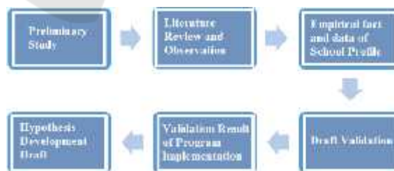
Figure 2: Analysis method mechanism chart in the field.

Figure 2 shows the mechanism outline of research methods as a development of analysis mapping chart. Once the data is enough, the study of theory continued with the execution at the field with patterns of documentation, observation and interviews to obtain empirical facts in school. The draft then was validated to see whether it was appropriate or not to be applied in a classroom setting in implementing the classroom setting in school curriculum in this inclusive settings, of which we have developed from this hypothesis until we bring the assumption of this hypothesis. This chart can be said as an accurate analysis of descriptive research methodology than the previous research of data collection method (Sugiyono, 2013).