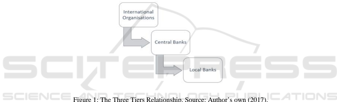
Figure 1: The Three Tiers Relationship.

As can be seen from the Figure 1 above, the three tiers relationship appears to have coherent effects of standardisation and practices. Eventually all the local institutions embed the same standards. By incorporating the standards into the local jurisdictions