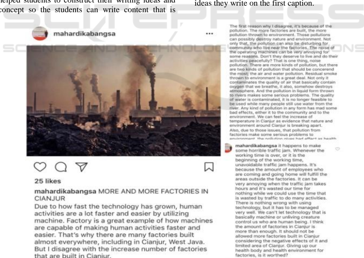
Figure 4: A Student Posts Two Captions to Describe a Picture due to Limited Space.

Some students state that it is challenging to describe a picture in Instagram caption since Instagram limits the characters that they can type. They have more ideas and words to express but some of them should be omitted for space reason. For few students who do not want to limit their ideas, they even post the caption twice with the second caption continues the ideas they write on the first caption.