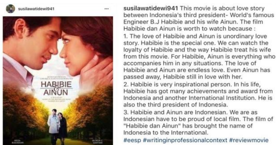
Figure 3: Example of Student's Photo Caption on Three Reasons Why You Should Watch the Movie.

place and writes his reasons and arguments of why the place deserves to visit and why this place should be considered as the best spot for food.