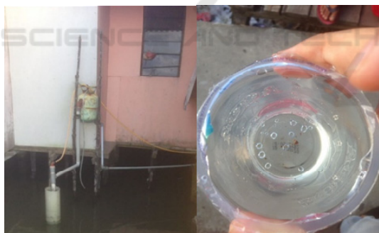
Figure 1: Conditions of water supply in Kampung Nelayan Seberang Belawan.

One of the fishing village in Medan City is Kampung Nelayan Seberang in Medan Belawan Sub-district. Kampung Nelayan Seberang is located on the outskirts of the river and sea. This condition affects the water used by the community for daily activities and water for consumption. Because the quality of brackish water is not feasible for consumption then the fulfillment of clean water needs in Kampung Nelayan Seberang is to make wells drilled either for private property or the government whose water is used for consumption as drinking water and for cooking. In addition, water wells are also used by residents for MCK activities (bathing, washing, and serving as a lavatory). The condition of the clean water availability in Kampung Nelayan Seberang can be seen in Figure 1.