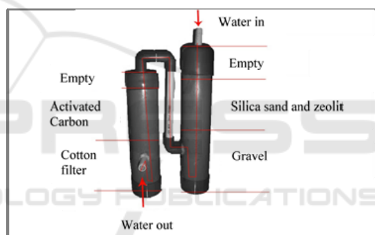
Figure 6: Sketch of a simple water purifier (Sumardika, 2012 modified)

In addition to the problem of water availability which is still lacking, the other residents' problems that the water is cloudy and has taste. The solution to overcome this is to design a simple water purifier such as a sketch in Figure 6.