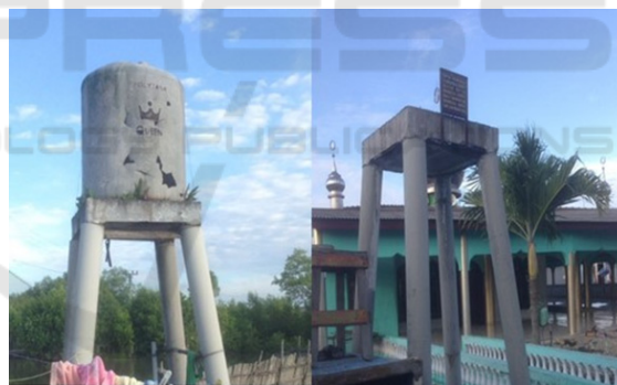
Figure 2: Damaged water reservoir condition and unused reservoir holder

In addition to the problems of affordability and continuity, some of the physical water quality of the borehole in Kampung Nelayan Seberang is cloudy and has sweet taste. In line with the target of SDGs, it is necessary to improve the quantity and quality of clean water service in Kampung Nelayan Seberang, Medan Belawan Subdistrict. One of the programs which can improve the clean water service in Kampung Nelayan Seberang is through community service program by University of Sumatera Utara.