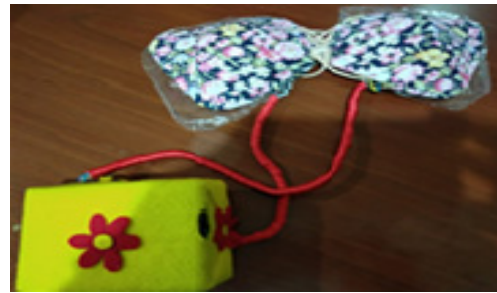
Figure 2 : DC Motor Vibrilatory Stimulus

List of components, ingredients and tools of breastmilk vibrator that can be used in the following table.