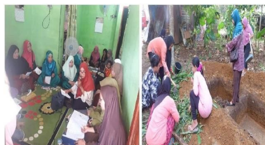
Figure 2. Theory presented by team (left) and practiced by team and community (right).

The implementation of the activities was carried out by means of counseling and lecture, explanation of integrated processing theory and techniques, which were followed by community groups in Namo Bintang Village, Deli Serdang Regency. Villagers listen to the material presented by the community service team as presented in Figure 2.