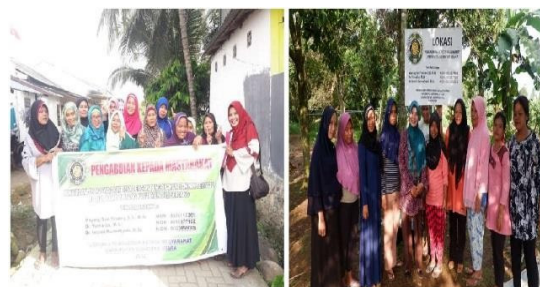
Figure 3. The team who conducted the social engagemment from USU and communities at Namo Bintang

materials are so simple that the village community can make their own. In addition, the village environment can be saved from the waste while the villagers improving their living standard because they can make their own handicraft and compost and sell them. The university team and community are conducted the training program as seen in Figure 3.