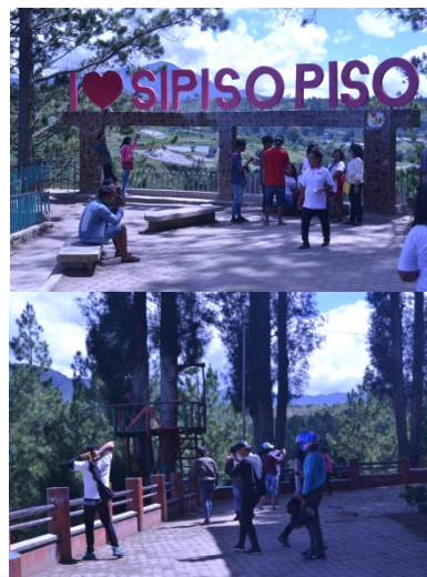
Figure 3: Unplanned Viewpoint.

unplanned viewpoint construction (figure 3). If this condition is left unchecked, it will damage the tourist area because excessive and unplanned land use will make the area unsustainable (Berke & Conroy 2000; Tyrväinen et al. 2014).