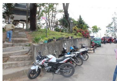
Figure 8: Vehicles parked on the road.

Although there are already special pathways for pedestrians, but in some functions such as eating places, especially mushollas that are very far compared to other functions, there is no pedestrian facilities. Tourists can walk along the edge of the road and relatively safe, but if it is crowded, the roadside is filled with vehicles such as cars and motorbikes that require tourists to walk a little to the middle of the road, this is very dangerous (figure 8). Supposedly, there is a special pedestrian path that connects one function to another, because if tourists feel that their safety is not guaranteed they will not go to that place (Mansouri & Ujang 2016). This will make some function not visited by tourists.