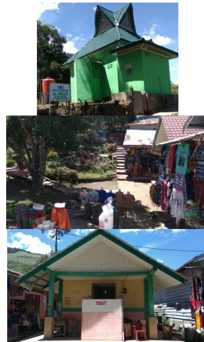
Figure 5: Condition of Musholla, Souvenir Shop, and Toilet in Sipiso-Piso Waterfall.

From the elements of facilities and infrastructure, the land function built in Sipiso-piso Waterfall is quite complete, there are souvenir shops, eating places, toilets, places of worship, and parking lots (Figure 2). Nevertheless, although it is quite complete, the facilities are inadequate conditions, such as souvenir shops and food places, where the place is less representative and attractive, the existing toilet is also poorly maintained, as well as places of worship that although new but not maintain and have no water (Figure 5). These facilities should be well maintained so that visitors feel comfortable at the tourist attractions, because a tourist place must have good and adequate supporting facilities to support the needs of visitors so that they are comfortable, comfortable, and want to return to the place in the future (Ginting & Sasmita 2018; Inskeep 1987).