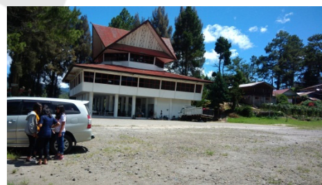
Figure 6: The biggest parking lot that is not used.

The parking lot at Sipiso-piso Waterfall can be said to be quite adequate, but there is no good planning, because if there are a lot of visitors, their vehicles will parked along the road and open space. Whereas there are three parking lots at there (figure 2), but the parking area are irregular, besides that the most extensive parking lot is rarely used by visitors (figure 6). Supposedly, th parking lot should be well organized, because it can affect tourist satisfaction and make them want to return to the place (Ginting, Rahman & Nasution 2017).