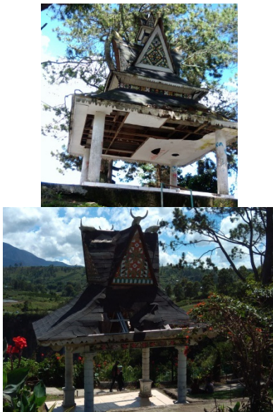
Figure 4: Seats that are not well maintained.

From the elements of facilities and infrastructure, the land function built in Sipiso-piso Waterfall is quite complete, there are souvenir shops, eating places, toilets, places of worship, and parking lots (Figure 2). Nevertheless, although it is quite complete, the facilities are inadequate conditions, such as souvenir shops and food places, where the place is less representative and attractive, the existing toilet is also poorly maintained, as well as places of worship that although new but not maintain and have no water (Figure 5). These facilities should be well maintained so that visitors feel comfortable at the tourist attractions, because a tourist place must have good and adequate supporting facilities to support the needs of visitors so that they are comfortable, comfortable, and want to return to the place in the future (Ginting & Sasmita 2018; Inskeep 1987).