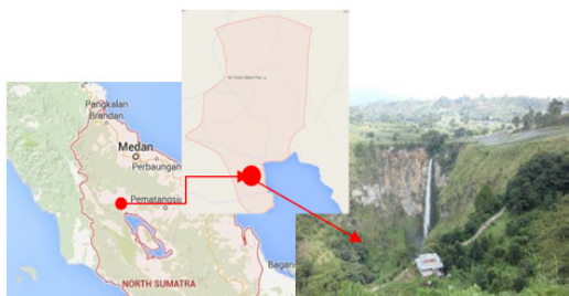
Figure 1: Sipiso – Piso, Tongging, Karo.

of about 1 hour down the stairs and to return to the top visitors must climb the same steps (Figure 1.).