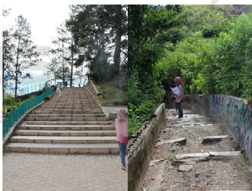
Figure 7: Condition of Pedestrian Path.

Between the function of one land use with the other function is related to circulation. Therefore circulation must be good especially in tourist areas. Good circulation will make all the functions that exist in an area come alive (Shirvani 1985). Unfortunately the circulation at Sipiso-piso Waterfall has not been well organized. There is already a special pedestrian route, even in the viewpoint and leisure areas (figure 7) is specially passed by pedestrians only. However, the road is damaged and has many holes. Pedestrian paths must be well designed because tourists will tend to walk around a tourist area if the physical path of the pedestrian route they are going through is comfortable and adequate (Mansouri & Ujang 2016).