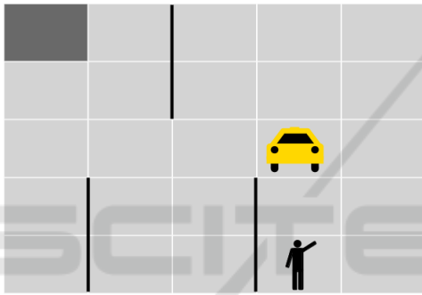
Figure 1: The taxi domain.

the taxi will end up East or West of its intended direction. Possible actions are moving North, East, South or West, collecting a passenger when standing on the same grid cell or dropping the passenger (when carrying one). Rewards are -1 for each regular move, -10 for dropping the passenger in the wrong location and 20 for delivering a passenger correctly, which also terminates the episode. We chose one instance of the taxi domain and obtained the total discounted reward of its optimal policy, 8.652, in order to compare it with the experimental results. This particular configuration and in general the taxi domain are illustrated in figure 1, where the dark cell at the top left corner is the goal depot where the passenger must be dropped. The walls shown in the picture are also included in the experiment which means the agent’s movement is restricted, in cells next to walls, to only open, adjacent cells.