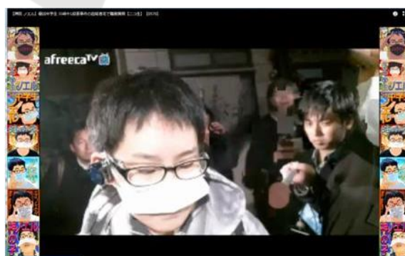
Figure 1: A screenshot of the podcasted movie ( http://www.afreecatv.jp/noeru ) *now deleted.

However, this case became especially memorable not only because of the savagery, but also in the context of the present paper. The then-15-year old podcaster, whose handle name was Noeru ( Noël ), somehow located and found the chief culprit’s family’s house and webcasted it across the globe. Figure 1 is a screenshot of the delivered movie (now deleted) showing a symbolic composition of a journalist holding out a microphone to a nameless boy as seen from his behind. The figure demonstrates that even a boy goes toe-to-toe with professional media in terms of competence for information transmission. Needless to say, Noeru (and other mappers) could determine a location by simply specifying aggregated place names and utilizing Google Street View to find the same exterior appearance of the home broadcasted by the mass media to detect the exact target location (termed ‘dataveillance’ by Clarke, 1988). Why would the non-involved boy do this? It is ratiocinative to consider his aspiring to fame and increased advertisement revenue, even if he becomes seen as an online ‘weirdo’.