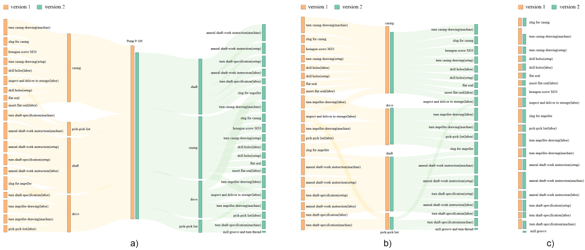
Figure 2: Visualizing two cost calculation versions with Sankey diagrams. Version 1 is shown on the left side (orange), and version 2 on the right side (green). It shows a comparison between the items on, a) the first level, b) the second level, and c) the third level, close to each other along with their sub-items.

with a different color (orange) in order to better distinguish between component split structures on the left (green) and location on the right (blue).