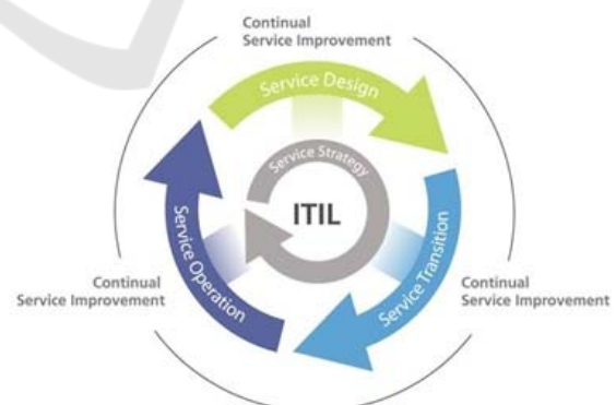
Figure 2: ITIL Service Lifecycle.

ITIL (Information Technology Infrastructure Library), is a set of concepts and best practices regarding the management of IT services, and describes in detail an extensive set of functions and processes designed to help organizations achieve quality and efficiency in IT operations (León, 2014). The latest version of ITIL, is structured in the following 5 processes with the objective of consolidating the "service lifecycle" model: i) Service Strategy, ii) Service Design, iii) Service Transition, iv) Service Operation and v) Continuous Service Improvement as shown in Fig 2.