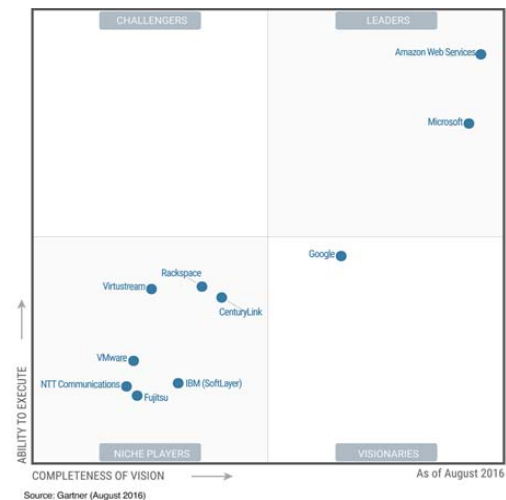
Figure 1: Gartner Magic Quadrant.