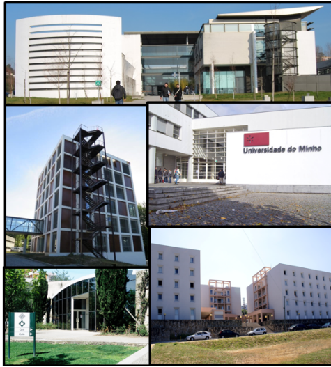
Figure 3: Map used in TechPaper.