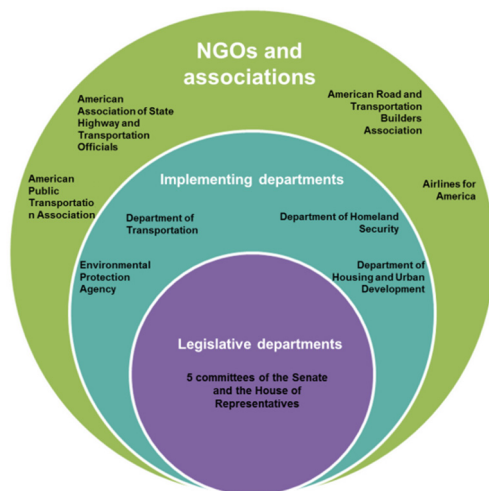
Figure 3 Functional departments for integrated transportation system management

In addition to the permanent specialized agencies, DOT is also flexible to set up cross-sectoral agencies. These non-permanent agencies are often aimed at the objectives of the US transportation strategies or authorization acts, such as transportation safety, intermodal convergence, improved competitiveness of freight economy, internal and external work coordination, and provision of advice on policy development to the department.