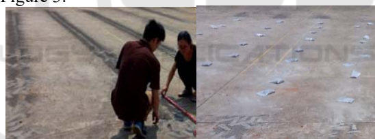
Figure 3: Test process diagram.

Electric control fertilizer test process shown in Figure 3: