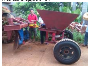
Figure 1: Rubber precision fertilizer machine structure.

Rubber garden electric ditching fertilizers mainly by the rack; open plow body assembly; fertilizer device; fertilizer assembly; limit wheel; dial grass assembly; control system and other structural components, the structure shown in Figure 1.