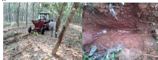
Figure 4: effect picture.

Field test process and the effect shown in Figure 4: