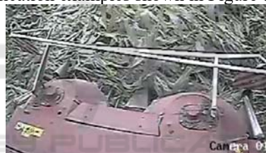
Figure 6: Agricultural machinery image acquisition map