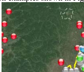
Figure 4: Agricultural machinery positioning map