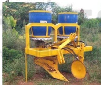
Figure 2: The main structure for rubber fertilizer machine.

Based on the visual monitoring technology, the rubber plant ditching and fertilization combined operation machine is designed with the technical ideas of combination of functions, comprehensive performance and remote management. The standard three-point rear suspension mainly includes the frame, suspension system, ditching system, Transmission system, remote monitoring system, etc., among which the fertilizer device includes a worm gear transmission, a main transmission shaft, a fertilizer tank, a disc, a scraper, a fertilizer hopper, a transmission shaft, a drainage pipe and a connecting frame. The whole machine should be able to complete a one-time rubber plant ditching, fertilizing, earthwork and other joint operations and remote office management functions. Machine structure shown in Figure 2.