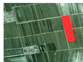
Figure 5: Agricultural machine trajectory query map