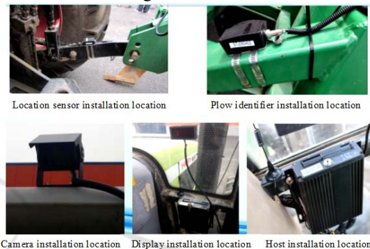
Figure 3: Remote monitoring system installation of the main parts.

The specific core components of the installation location shown in Figure 3.