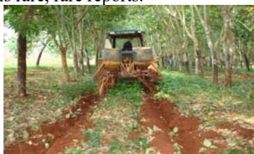
Figure 1: Double row fertilizers for rubber.

fertilization Machine and pressed green plow were applied in small scale in Qujie Town, Xuwen County, Zhanjiang City, Guangdong Province (Figure 1), and achieved good economic and social benefits (ZHANG Yuan, 2016). However, there were still some problems that affected their further promotion application. Such as fertilization machine with two rows of operations, the rubber tree root damage more serious, only 20 ~ 30cm depth of ditching, reducing fertilizer efficiency, and fertilizer is not uniform. However, ditching and pressing are all single tasks with low efficiency and labor intensity, and there are many problems such as stealing, leakage and acceptance difficulties in the management process. Abroad on the plastic garden ditching, fertilizer and other management machinery research is rare, rare reports.