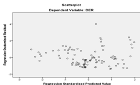
Figure 2: Heteroscedasticity Test.

Figure 2 shows that the points are spread randomly either above or below 0 on the Y axis. This shows that heteroscedasticity on the regression model is non-existent.