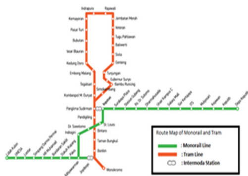
Figure 2: A Route Map Showing the Routes taken by Suro Tram and Boyo Rail (2014)

Furthermore, the successful of urban rail transit system in Surabaya will be reached when it can fulfill the three requirements (Ristia,2009) as follows: