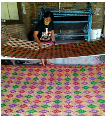
Figure 1: Process Batik.

The old mosque located in Kedunggudel Village Kenep Sukoharjo subdistrict is named Masjid Darussalam. The mosque which is a cultural heritage has architecture like the Great Mosque of Demak. Mosque building is reinforced with 16 piles of teak wood. Interestingly the mustaka or mosque head is not in the shape of a dome but the wijaya kusuma flowers. The mosque was founded since the 14th century and became the center of civilization and the spread of Islam in Java. Once this mosque is surrounded by boarding school. Because it is located near Bengawan Solo River makes alim ulama make it as the center of the economy. Darussalam Mosque is often used by Raja Keraton Solo Paku Buwono VI to discuss with Prince Diponegoro to discuss the strategy of war against Dutch colonialism (Solopos, 2018). The mosque was last renovated in 1837 and still stands today.