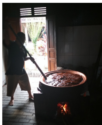
Figure 3: The Process of Making Jenang.

Tourism Village themed creative village located in Kenep Sukoharjo Central Java Indonesia begins by the desire of citizens to introduce the potential of creative industry in its area. This tour activity is managed by Pokdarwis i.e. Group of Conscious Tour named Kampung Sanga . The Kenep youth community called Lumbung Budoyo is also active in the development of Kenep tourism village. Members of the Lumbung Budoyo community numbered 20 youths. Pokdarwis and Lumbung Budoyo are under the coordination of the Sukoharjo Central Sukeparate government. Institutional and management of tourism activities have been arranged by arranging stewardship and division of tasks and obligations (Praswati, 2018).