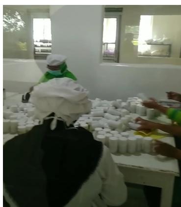
Figure 2: Herbal Making Process.