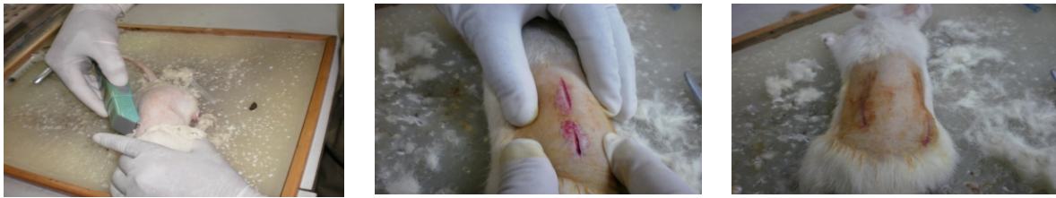
Figure 1: Sprague Dawley Rats : (A) kept in steril dressing; (B) incisions 2 cm each; and (C) healed wound.