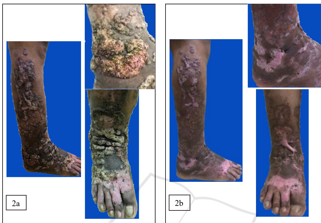
Figure 2. a. Before treatment, cauliflower-like lesions, b. After 4 month combination therapy, the lesions smaller, thinner, black spots disappear.

Diagnostic techniques of CBM are based on physical and direct examination, culture and histopathology. Queiroz, 2009 From direct scrap of KOH and skin biopsy in the lesion surface containing black spots, we could find the disease hallmark of CBM or pathognomonic fungi structure: muriform cell or sclerotic bodies or fumagoid cells or copper pennies. (Queiroz, 2017; Queiroz, 2015; Queiroz, 2009) Muriform cells had thick wall like chestnut, round-shaped, brown color with cross chamber, transversal and longitudinal, and this is as result of fungi adaptation in order to survive in the host tissue. (Queiroz, 2017; Queiroz, 2015) The sensitivity of direct examination with KOH for CBM was 90-100%. (Queiroz, 2017) Therapy may be started upon the demonstration of muriform cells, however, culture identification is important because Fonsecaea species may be less sensitive to antifungals. (Queiroz, 2017) From all the signs, symptoms and examinations results in this patient we concluded the diagnosis was CBM and categorized as severe degree based on the lesion size of more than 15 cm 2 . 13