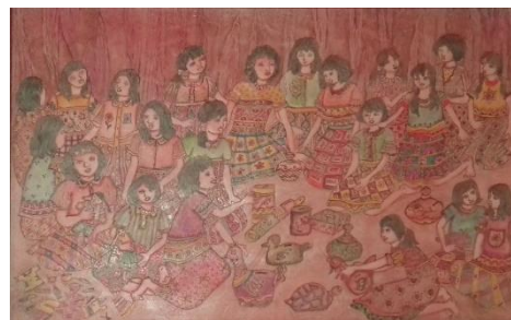
Figure 2: Braille painting works niken larasati title "Pasaran".

and meet face-to-face. This activity is included in the social interaction of how to deal with situations, conditions, communication, and possible difficulties during the game. Game play activities traditional become more effective when done in collaboration with educators, in this case the parents and teachers as a learning medium.