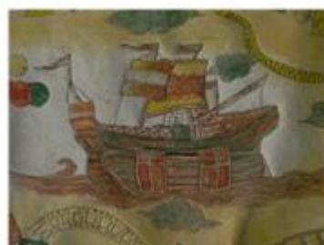
Figure 4: Some braille paintings by Niken Larasati (Source: Author's documentation, 2014 & 2017).

Niken's artworks analysis using semiotics in qualitative research has a compliant component consisting of questions posed, sources potential of signs, and gestures. Based on observations of Braille