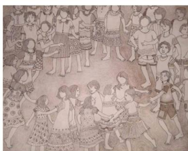
Figure 5: Sketches of braille paintings which tied on the skin.