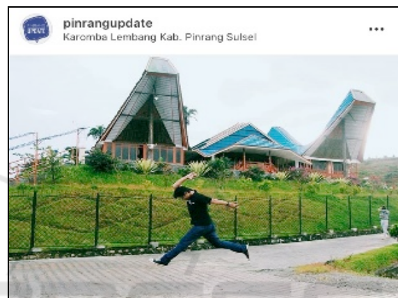
Figure 1: Puncak Karomba

Bakaru Water Power Plant is a dam and irrigation source that irrigates Pinrang and the surrounding districts. This place does not have special access as a tourist spot, but the post-images create curiosity and awe. Bakaru hydropower is not included as a tourist destination based on the Tourism Office documents.