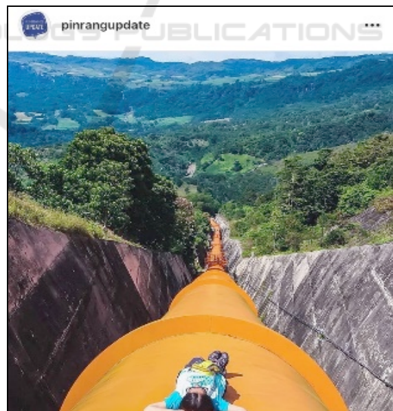
Figure 2: PLTA Bakaru