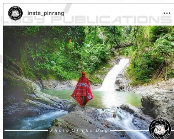
Figure 5: Air Terjun Kalijodo

According to respondents interviewed, this increases the attractiveness of the posts. However, the existence of the caption may be due to reposting. The captions also contain criticisms of the government as seen in the post about the hills of Lembang area in Bungi village.