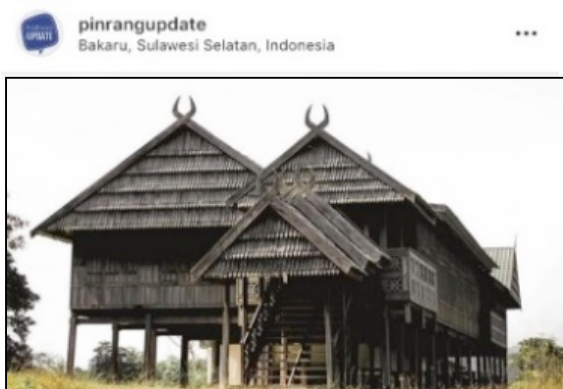
Figure 3: Rumah Soroja

Soroja's house is a kind of old royal house in Pinrang. This spot is generally unknown. This spot is also not included in the flagship destination. Field observations show old houses that are not groomed and that look mediocre.