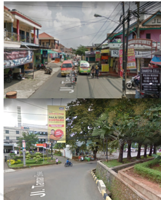
Figure 3: Gunungpati Sub-district.