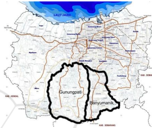
Figure 1: Location of research.

The research material is Banyumanik and Gunungpati Sub-district Areas. This area is located in urban fringe area of Semarang City with the supporting function of the Semarang City Area below as a conservation area. Of the two sub-districts, some urban areas will be taken as a sample of research data that can describe the physical condition of regional development.