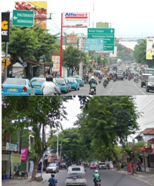
Figure 2: Banyumanik Sub-district.