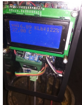
Figure 2: Measuring temperature, humidity and soil pH.

After going through according to the steps that are in accordance with the RnD research method, the final results are prototypes of soil temperature, humidity and pH measuring instruments as a tool in analyzing the influence of the three variables on soil type resistance. Figure 2 shows the process of measuring temperature, humidity and soil pH.