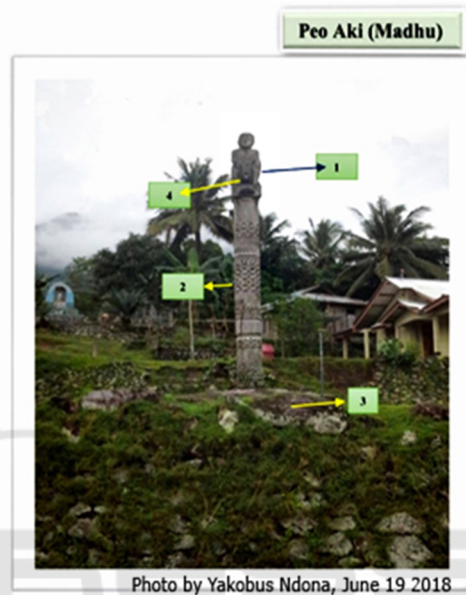
Figure 1: Peo Aki or Madhu. Peo aki has four basic elements, namely pu'u Peo or Peo's base (number 3), toko Peo or Peo's pole (number 2), and ana jeo or the statue of naked man (number 1), with male genital (number 4).

base of the branch that describes the female genitalia, and earrings (uli wolo) on the East and West sides of the base branch, which emphasizes the feminism of Peo fai. On every side of the base of Peo fai, there are carvings of stars and earthly creatures (scales, centipedes, lizards and crocodiles). On the back of both branches, there are carvings of the palm leaves, and on the top of every branch, there is a statue of a magpie (koka).