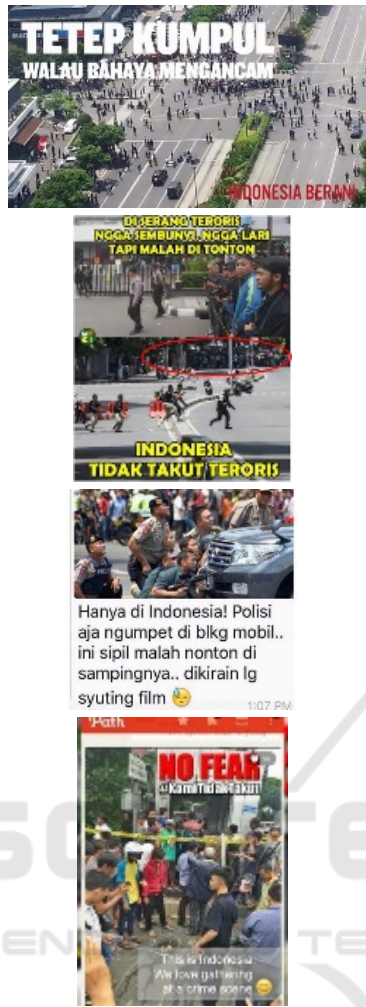
Figure 3: People are watching around the terror scenes

The messages from these memes are created through the combination of the signs of the language by using some words as its captions, the jargon as the symbol of countering terrorism or CVE, and some photos related to the context. It can be said that the creators of the memes try to communicate to the audiences of the internet and social media by giving the messages.