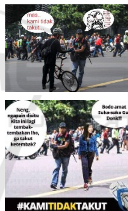
Figure 2: The People say 'We are not afraid of the terrorist.'

The same messages are shown through different variation of memes (Fig. 2) that show the images of people (edited photo of the terrorist with other people) saying directly to the terrorist that they are not afraid of terrorist.