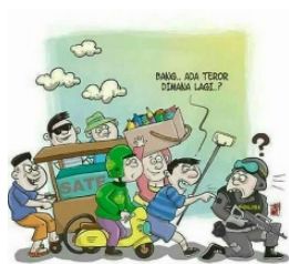
Figure 6: The joke shows the sellers want to go to other terror scenes

Another meme related to the street seller is a comedy picture of street sellers that want to go to another terror scene to sell their food (Fig. 6). This is understood metaphorically as a joke and symbolically as a symbol of bravery to fight against terrorism. This also shows that ordinary people from food street sellers are also part of the movement in fighting terrorism.