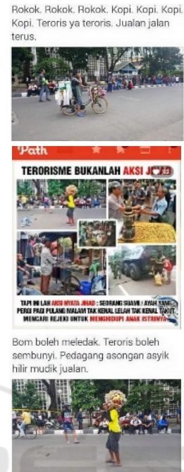
Figure 4: The drink and snack sellers close to the terror scene.

show the condition on the scene after and during the attack and the courage of the crowd who were not afraid of the terrorists and also as a symbol of supporting the police. The messages are strongly delivered through the photos supported by the captions.