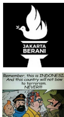
Figure 1: Memes with the hashtag of "We are not afraid" (#Kamitidaktakut)

The same messages are shown through different variation of memes (Fig. 2) that show the images of people (edited photo of the terrorist with other people) saying directly to the terrorist that they are not afraid of terrorist.