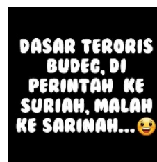
Figure 7: Parody to mock and joke the terrorist

Mocking and joking terrorist by using memes is also can be said as one of the ways to look the terrorists down and fighting them back. As it is said by Faturochman, a social psychology expert at Gadjah Mada University (UGM) Yogyakarta, that such memes as acts of resistance or anti-terror against the tragedy of terror and not because of insensitivity. Forms of resistance or anti-terror acts can be varied and for those who do not have weapons, making the incident as a joke or mocking the terrorist is one of their ways that can be done. Thus, the people try to overcome its fear by changing it fighting terror through memes. He also mentions that in this case "Indonesians have different characteristics compared to Europeans or Americans. Indonesians are more relaxed" in responding to the case that compared to European and Americans (Syarief, 2016). In other words, Indonesian people have several ways and strategies to fight against terrorism or countering violent extremism, and one of the creative ways is by using internet memes and mocking the terrorist and their actions.