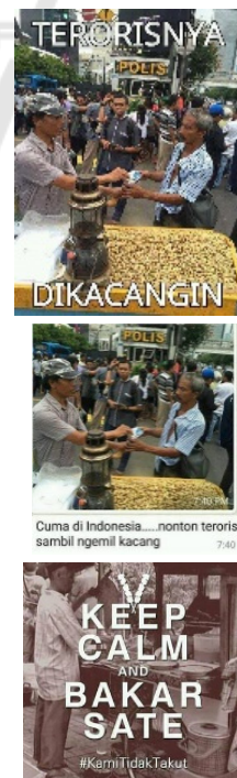
Figure 5: The peanut and satay sellers close to the terror scene