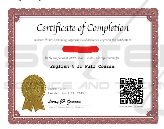
Figure 2: English4IT Certificate