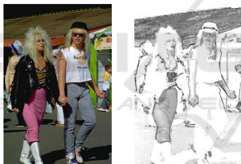
(a) Sample "23050"

An use of this gradient can be seen in the figure 3. It's behavior is similar to others colors gradients, but the border is only enhanced where the color transition is disharmonic.