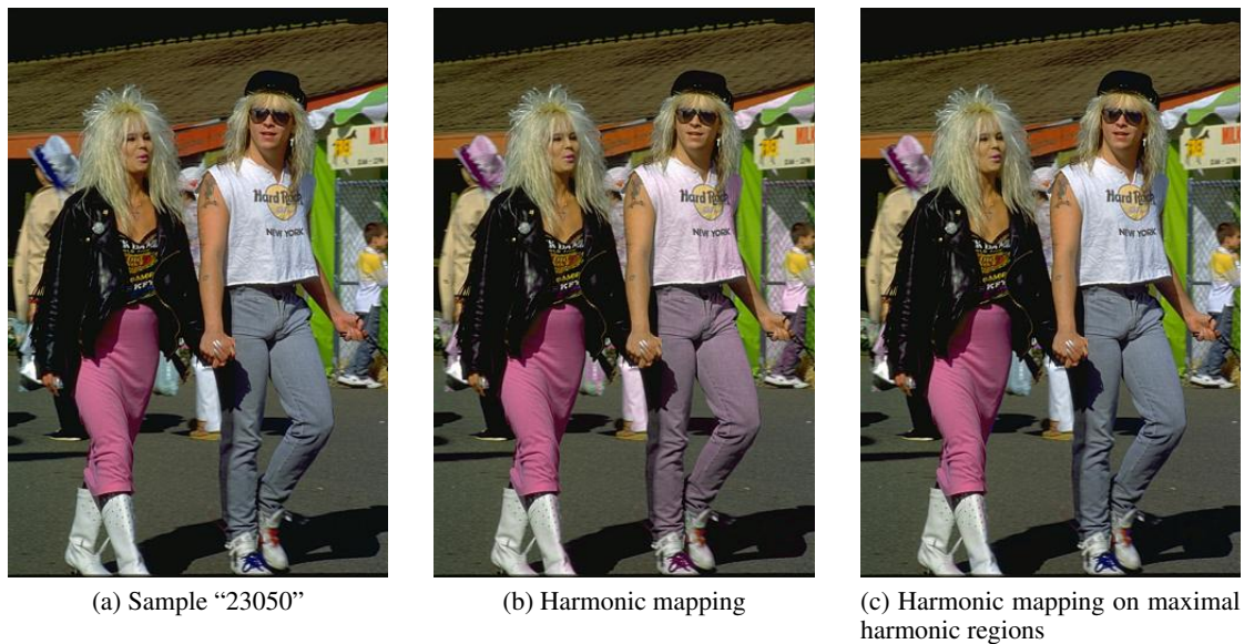
Figure 5: Comparison of the hue mapping with and without the support of the harmony criterion.

Future works include the proposal of improvements to the implementation of color attribute operators, like the use of a newer representation (Souza et al., 2015; Xu et al., 2017) or an optimization of the opening with the use of Viterbi algorithm (Viterbi and Omura, 1979) and the proposal of new color criteria for attribute color processing.