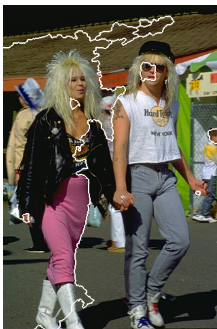
Figure 4: Example of harmonic segmentation.

Then, for each segment, it was chosen the template and rotation that minimized the intra-region divergence and the hue values where mapped according