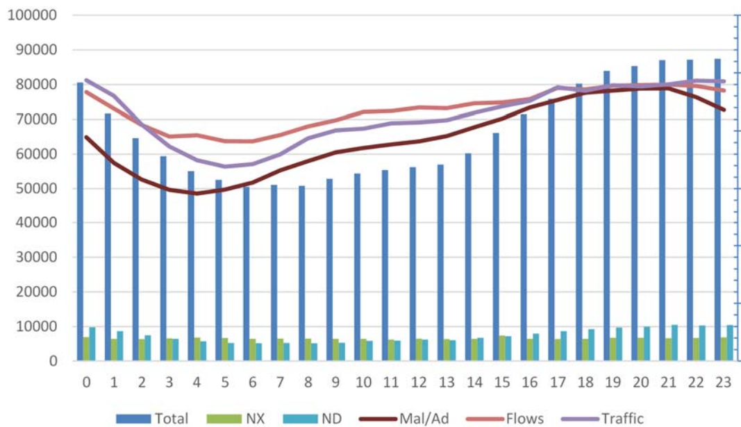
Figure 2: Measurements against the hour of the day.

reflection attacks, potentially supporting DoS attacks against name servers. This would be especially prominent in reverse scans, as these are all going to the same nameserver(s) if a single/few TLDs are chosen.