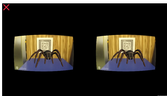
Figure 2: Image accessed by the professional.

Figure 2 shows an example of the image of one of the steps, accessed by the professional.