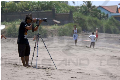
Figure 5: Shoot process from the land. Shooting support tools like this is tripod that function as a support and reinforcement of the camera.