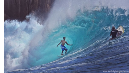
Figure 7: Shoot process in the middle of the wave