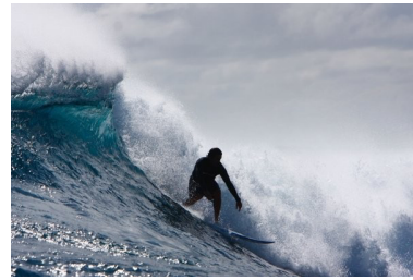
Figure 6: Result shoot in the middle of the wave

Shoot in the middle of the wave is relatively difficult, risky, and requires extra equipment. The photographer's expertise was being tested in the shoot in the middle of the surf because of the hard of the shoot. The extra tool takes in this photo shoot is casing underwater, a rubber boat, jet ski, and safety tool like a safety life jacket. A photographer's understanding of surf sports is needed to be able to take photos at the right time. A commonly used lens is a wide-angle lens. Beneath the degree of difficulty and risk, a shot in the waves can point to dramatic moments of surfing. Besides the beauty of the waves and the land can also be seen in the photos.