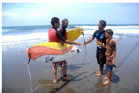
Figure 3: Approaching process to new customer

This shoot was modeled after an agreement between photographers and surfers. Technically this photoshoot is the same as the first term. The difference only in the deal reached before the photoshoot. The deal accomplished primarily is that the surfer willing to portrait and willing to be revisit to handover the photos and to do the payment.