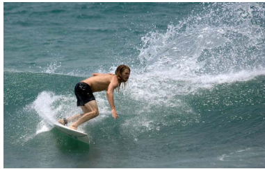
Figure 4: Result of the land shoot. This picture was done using a tele lens and high shutter speed.

Shoot from the land are relatively safer for photographers. The main instrument in this photo is a tele lens because of the distance between the photographer and the subject. Also, the tripod would be required to anticipate the appearance of a tele lenses that could jiggle, so the photos are not vague. In the process of surfing shoots, continuous shoot is a helpful photographer to get to the surfer's moment of action.