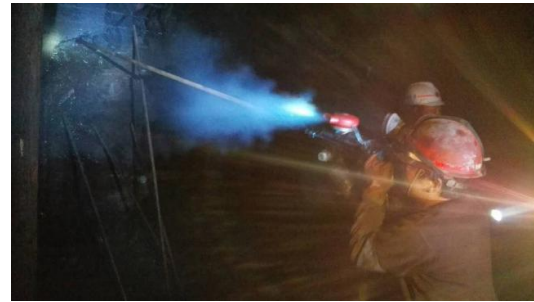
Figure 3. Field tests.

After the successful development of the above two new mechanisms, they took the lead in the application of S82 gas-leg rock drill. The first prototype was tested in a metal mine (see Figure 3) in Sichuan Province in 2017. The water pressure of the mine is 0.2 MPa higher than that of the wind pressure. The performance of the gas-leg rock drill fully meets the design requirements, helping customers to achieve rapid rock drilling, smooth operation, shorter working hours, lower costs and maximize the interests of customers. It is fully recognized by customers.