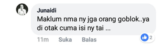
Figure 6: Comment Facebook Fanpages 2019 Change President (Pro)

Based on the results of this post, the researcher received 15 comments, 104 likes, and 29 times were shared. Furthermore, the researchers categorized the comments based on these postings, namely those that were pro, contra and neutral. In the pro category, it will be marked with comments that support or give a positive response to the post. Then, the counter category will be marked with comments that do not support and do not respect or commit abuse. Neutral categories meant here are comments that are not included in the category of supporting or rejecting or having nothing to do with the issues of the post. Neutral categories here include accounts that only give likes in the form of emoticons as well as comments.