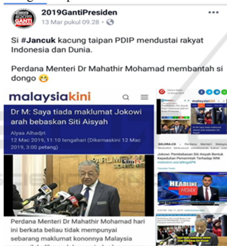
Figure 5: Display of Facebook Fanpages 2019 Change President

Researchers have read some of the posts in these Fanpages such as written text, images and photos that contain elements of hate speech. From several posts and comments on this Fanpages, researchers have classified the data containing hate speech for research purposes. From some of the posts and comments contained on this Facebook Fanpages, researchers have selected various kinds of issues containing hate speech elements.