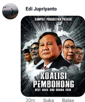
Figure 7: Comment Facebook Fanpages 2019 Change President (contra)