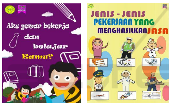
Figure 1: Poster media that used to increase students' motivation

poster media is 0,870. Then test the normality data and known the result for pretest control class = 0,565 posttest control class =0,874, and the result of pretest experiment class =0,676 posttest experiment class =0,911 in the term sig > 0.05 and claimed that data is normally distributed. The homogeneity of pretest control class and experiment class, sig= 0,237. the homogeneity posttest control class and experiment class, sig= 0,421. Sig pretest and posttest control and experiment class 0,237 and 0,421 >0.05, so data obtained from the same variant (homogen). And also Test-t result known t_{hitung} = 3,434 with freedom degree (df) 70-2 = 68 and significant level 0,05 while t_{table} = 1,996 . Because t_{hitung} > t_{table} ( 3,434 > 1,996 ) so H_0 is acceptable, means there is an effect from poster media to social science learning motivation. Here are process of using poster media at third grade students SDN Sudimara 10 Ciledug, Tangerang City.