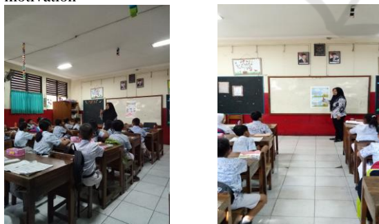
Figure 2: Social science learning using poster media

At the time learning using poster media applied on experiment class, it made students more motivated, they were not bored and enthusiastic since it attract their attention and grow their learning enthusiasm. Students were able to learn happily because they learn using media, so that teaching materials are more easily delivered by teacher to students. Students also become active, innovative, creative, effective and fun at learning process, and it forms students to express their opinions and students