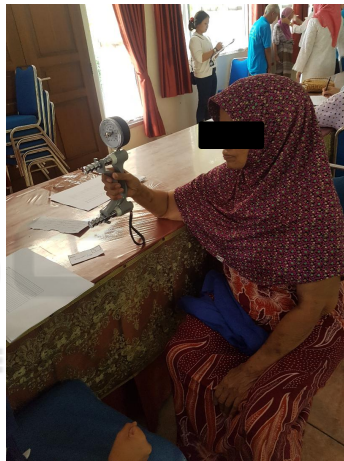
Figure 2: HGS data sampling.