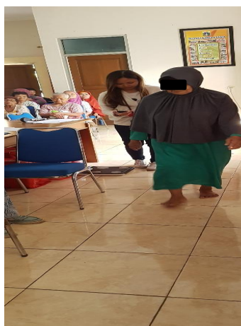
Figure 3: Gait speed data sampling.

All included subjects agreed to perform several tests; the measurement of appendicular skeletal muscle mass (ASM) in \text{Kg/m}^2 using “TANITA” body impedance analysis, hand grip strength (HGS) in Kg using Jamar Hand Grip, and gait speed (GS) in m/sec evaluated by measuring the time on four meter gait test using stopwatch.