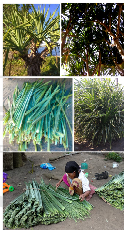
Figure 1: Thorny pandanus plants in Pangandaran Regency.

ize the advantages of quality and sustainable products. The rationale is through the cooperation between the academic sector, the craftsmen community, hoteliers, local traders and exporters, and the government as policy and regulation makers. The local government requires the hotels to purchase or distribute products (hotel slippers) made by local artisans. Moreover, thorny pandanus fibers can be used for composite building materials, such as Asbestos, GRC (Glass-fiber Reinforced Cement) with several variants (GRC Panel, GRC Cladding, GRC Jali, GRC Reinforced, GFRC (Glass Fiber Reinforced Concrete), etc.) and also interior body kit for cars, trains, and motorized tourist boats or canoes.