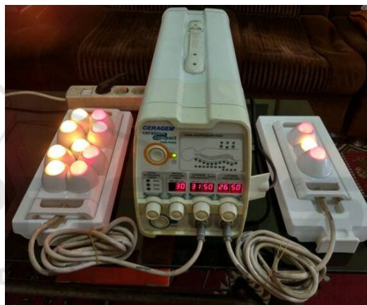
Figure 2: Ceragem Therapy Tool

This is a Ceragem therapy tool that is used for patients who have gout complaints, this tool is very easy to get because it can be ordered directly to the Ceragem therapy center or can be ordered via online