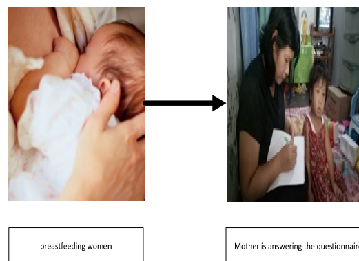
Figure 2. Research on the Effect of Breastfeeding Conditions and Characteristics of Breastfeeding Mothers on LAM usage as Contraception.