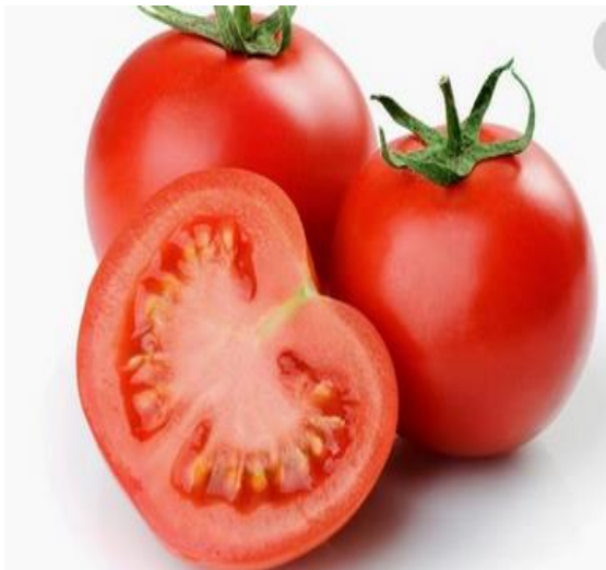
Figure 1: Picture of Fresh Tomatoes